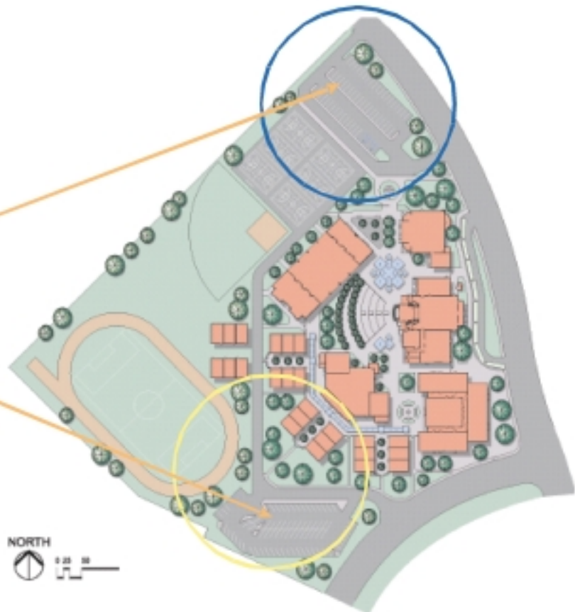
Figure 4 - Impacts on Parking and Site Configuration

If possible, design the parking lot with one-way circulation