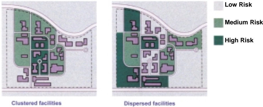
Figure 2 - Site and Building Layout

A key concern is how to site buildings on the available land and